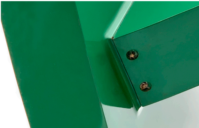
CLOCKWISE FROM TOP LEFT: DETAIL OF INSTALLATION HARDWARE AND CONSTRUCTION (NOV 22, 2019); THE SCULPTURE AS SEEN IN PROFILE; HARING SIGNATURE, DATE, PERSONAL INSIGNIA AND "ACF" FABRICATOR'S INITIALS; AND AT LEFT, A DETAIL OF THE FIGURE'S EXTENDED RIGHT ARM AND UP-LIFTED RIGHT LEG CREATING THE ONLY VISIBLE SEAMS, ALONG WITH A DETAIL TWO EXPOSED BOLTS.