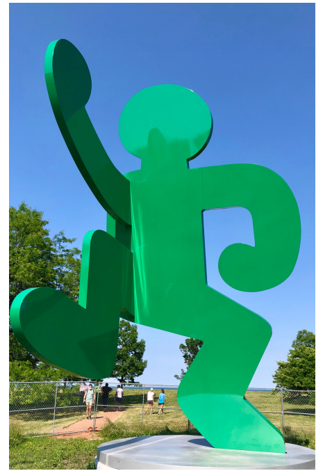
▲ 'Self-Portrait' at the garden site, June 2020