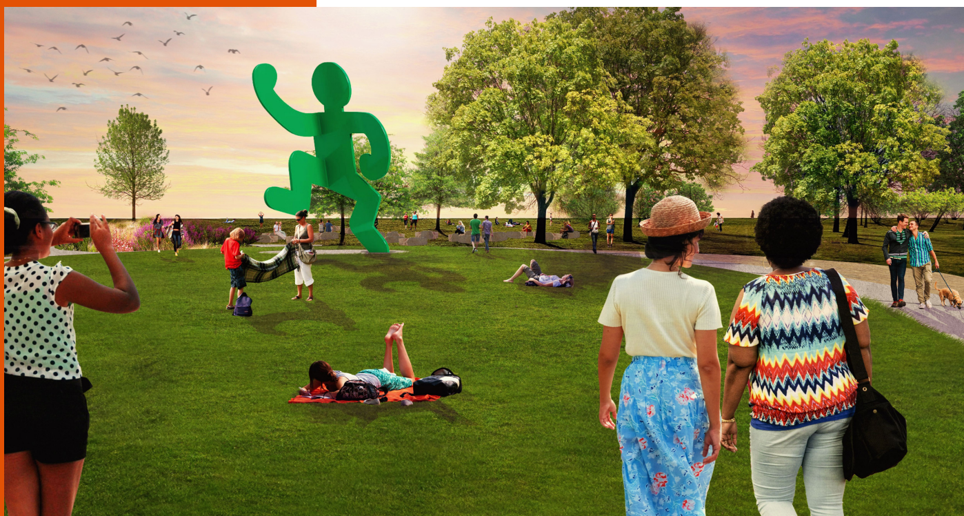
Sculpture Credit: Keith Haring Foundation

IN PARTNERSHIP WITH THE CHICAGO PARKS FOUNDATION