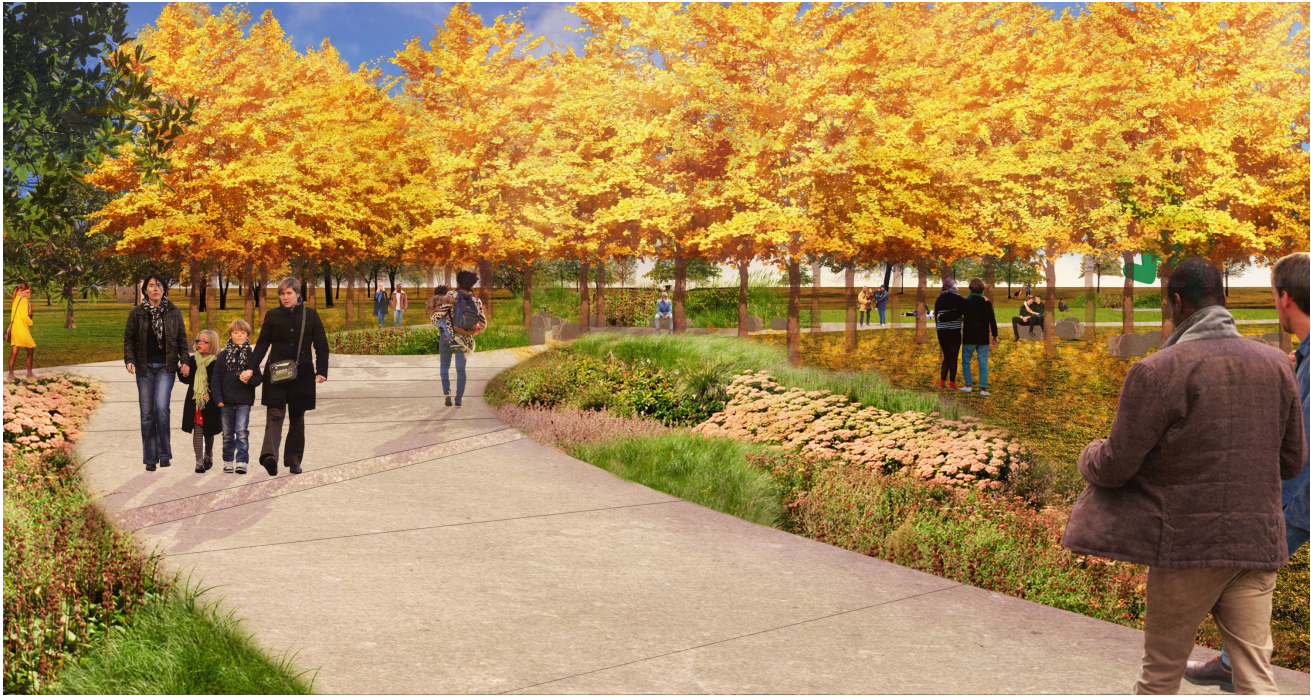
▲ Ginkgo Grove view from Unity Garden, Design Workshop rendering