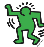
◀ Sculpture view from Celebration Lawn, Design Workshop rendering